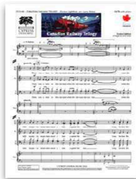
Canadian Railway Trilogy