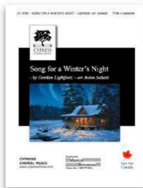
Song for a Winter's Night