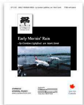
Early Mornin' Rain