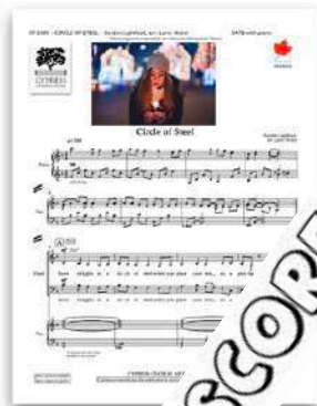
Circle of Steel