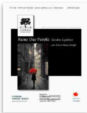
Rainy Day People