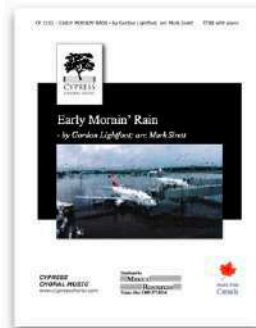
Early Mornin' Rain