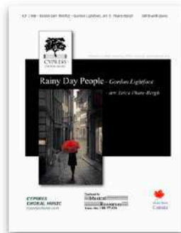
Rainy Day People