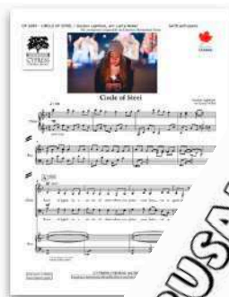
Circle of Steel

on: most titles are set for SATB, SSAA and TTBB