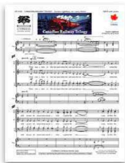
Canadian Railway Trilogy