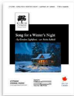
Song for a Winter's Night