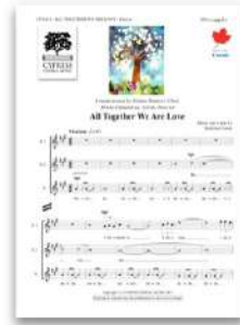
All Together We Are Love