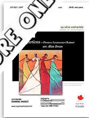
J'appartiens (I Belong)