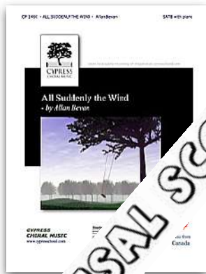
All Suddenly the Wind