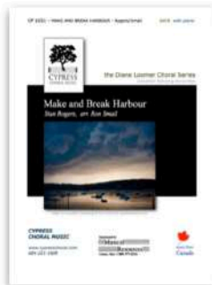
Make and Break Harbour