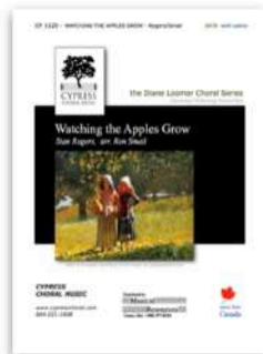
Watching the Apples Grow