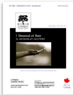
I Dreamed of Rain