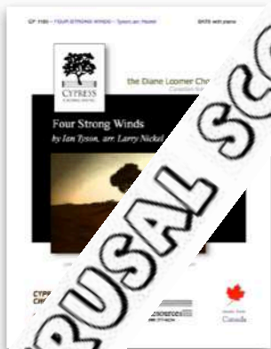
Four Strong Winds