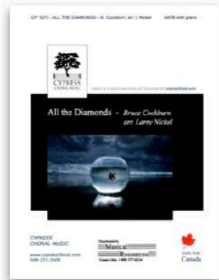
All the Diamonds