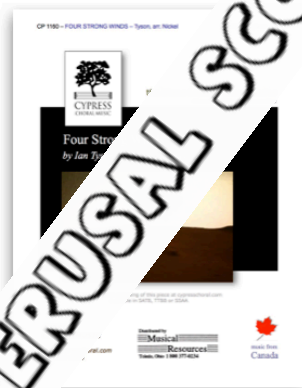
Four Strong Winds