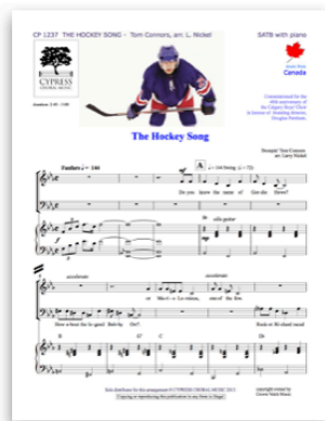
The Hockey Song