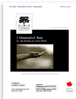
I Dreamed of Rain