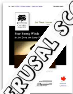
Four Strong Winds