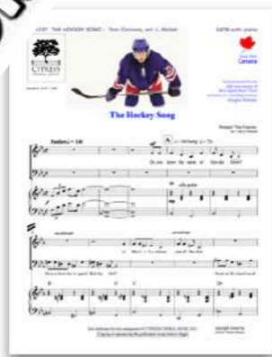
The Hockey Song