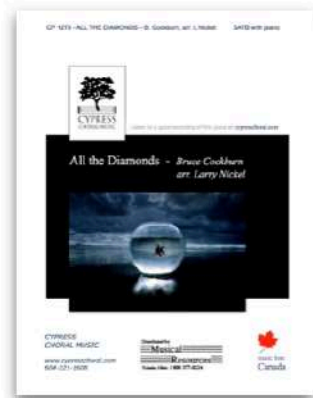
All the Diamonds