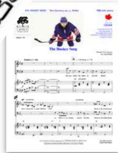
The Hockey Song