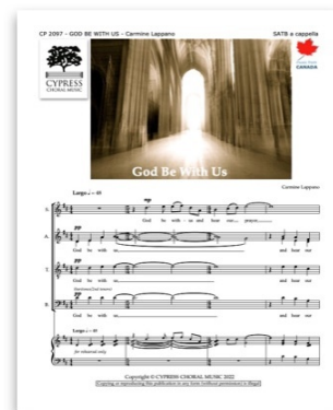
God Be With Us