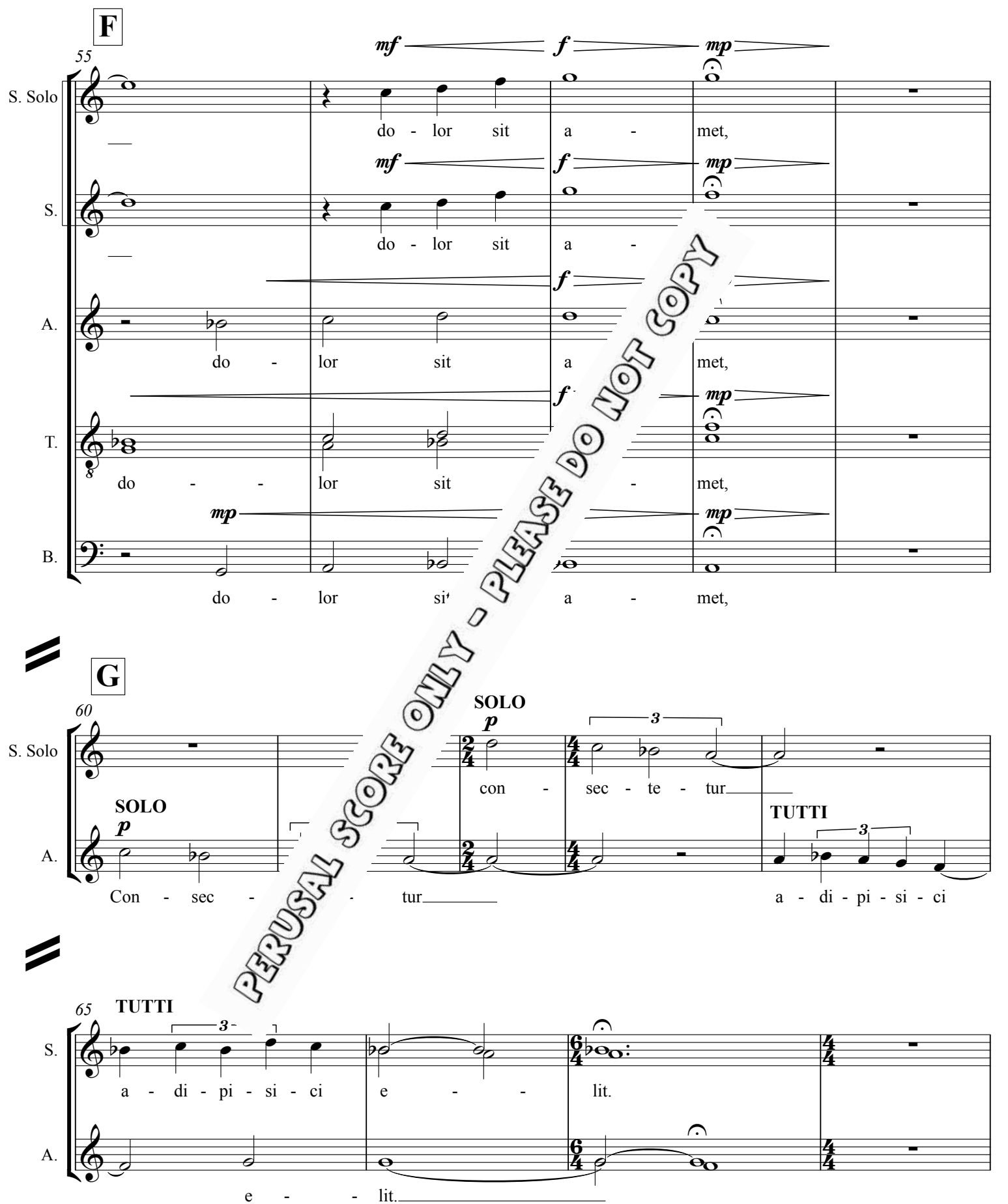
Lorem Ipsum © Jordan Nobles, North Vancouver, October 2010 www.jordannobles.com