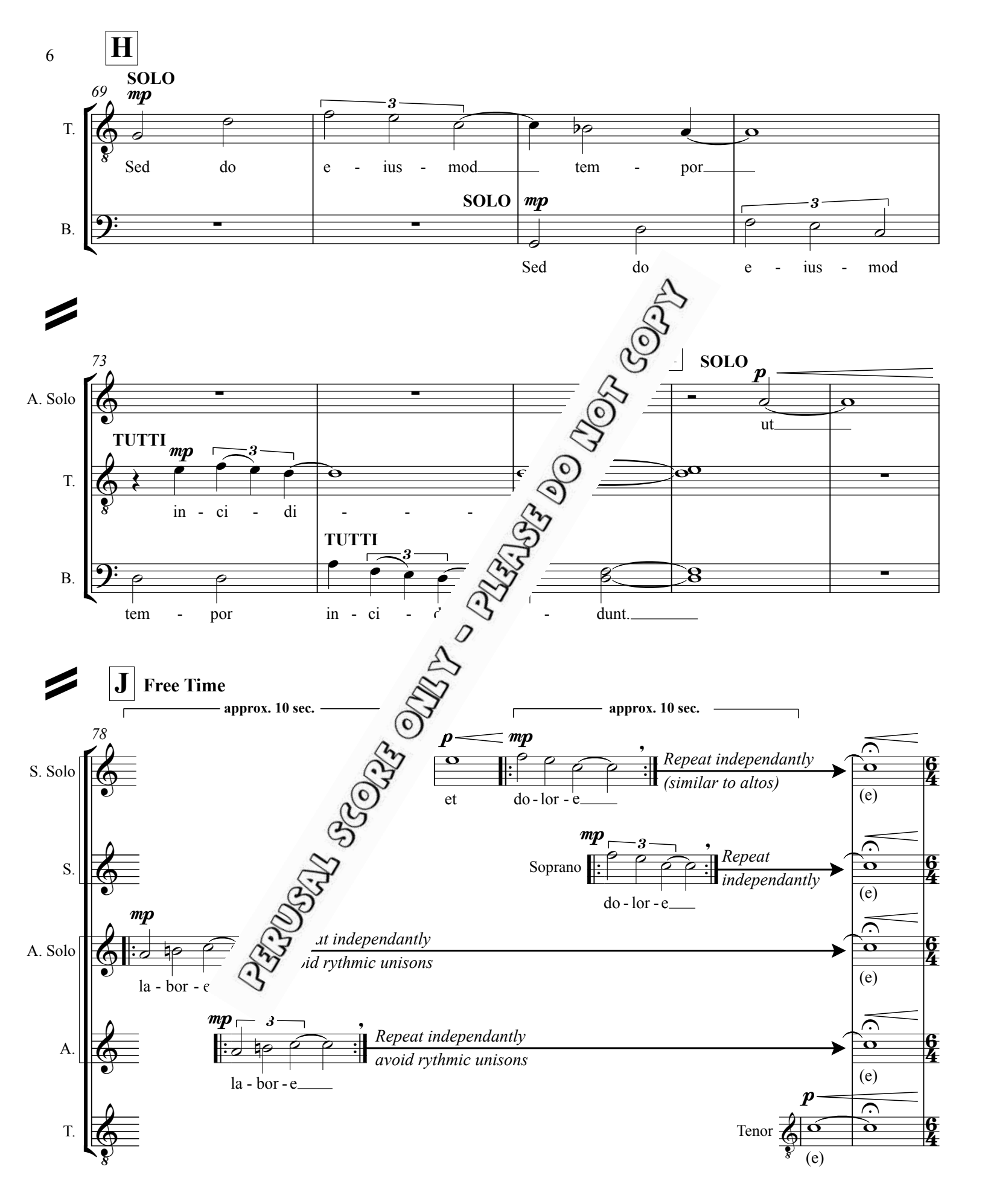
Lorem Ipsum © Jordan Nobles, North Vancouver, October 2010 www.jordannobles.com