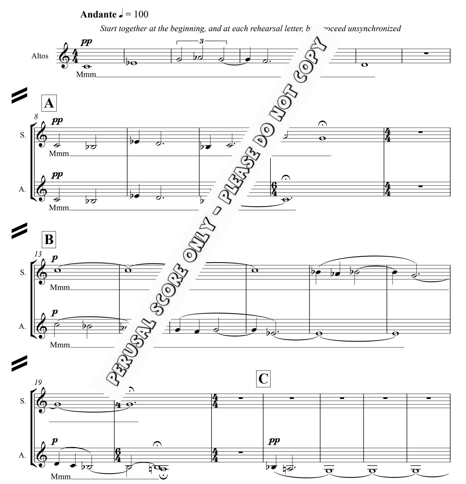
Lorem Ipsum © Jordan Nobles, North Vancouver, October 2010 www.jordannobles.com