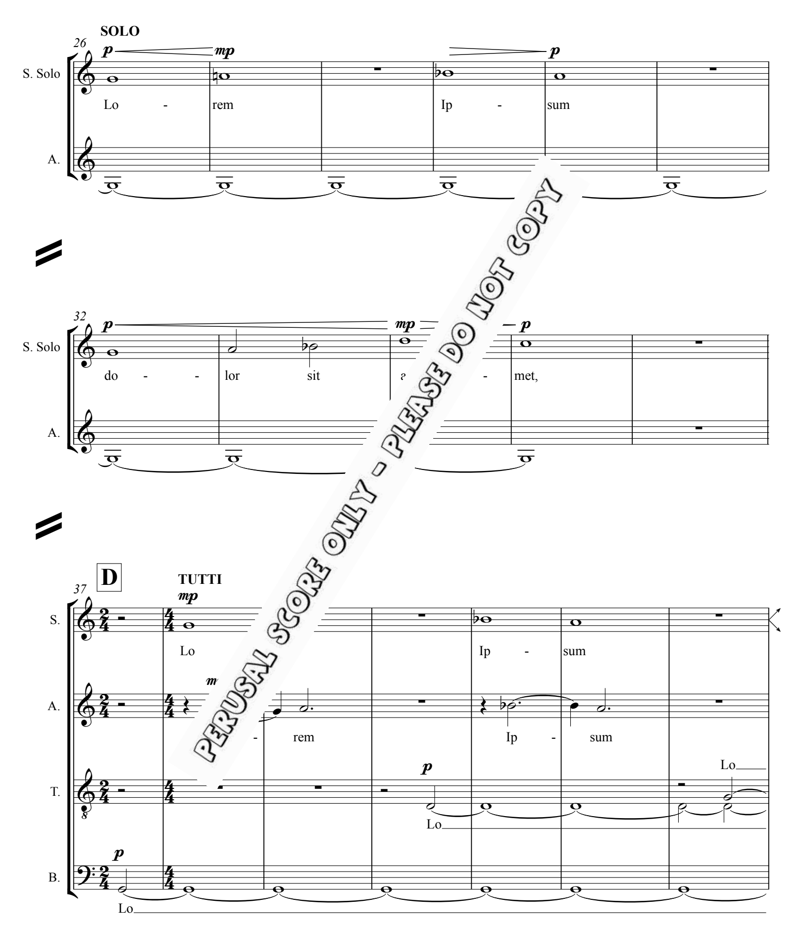
Lorem Ipsum © Jordan Nobles, North Vancouver, October 2010 www.jordannobles.com