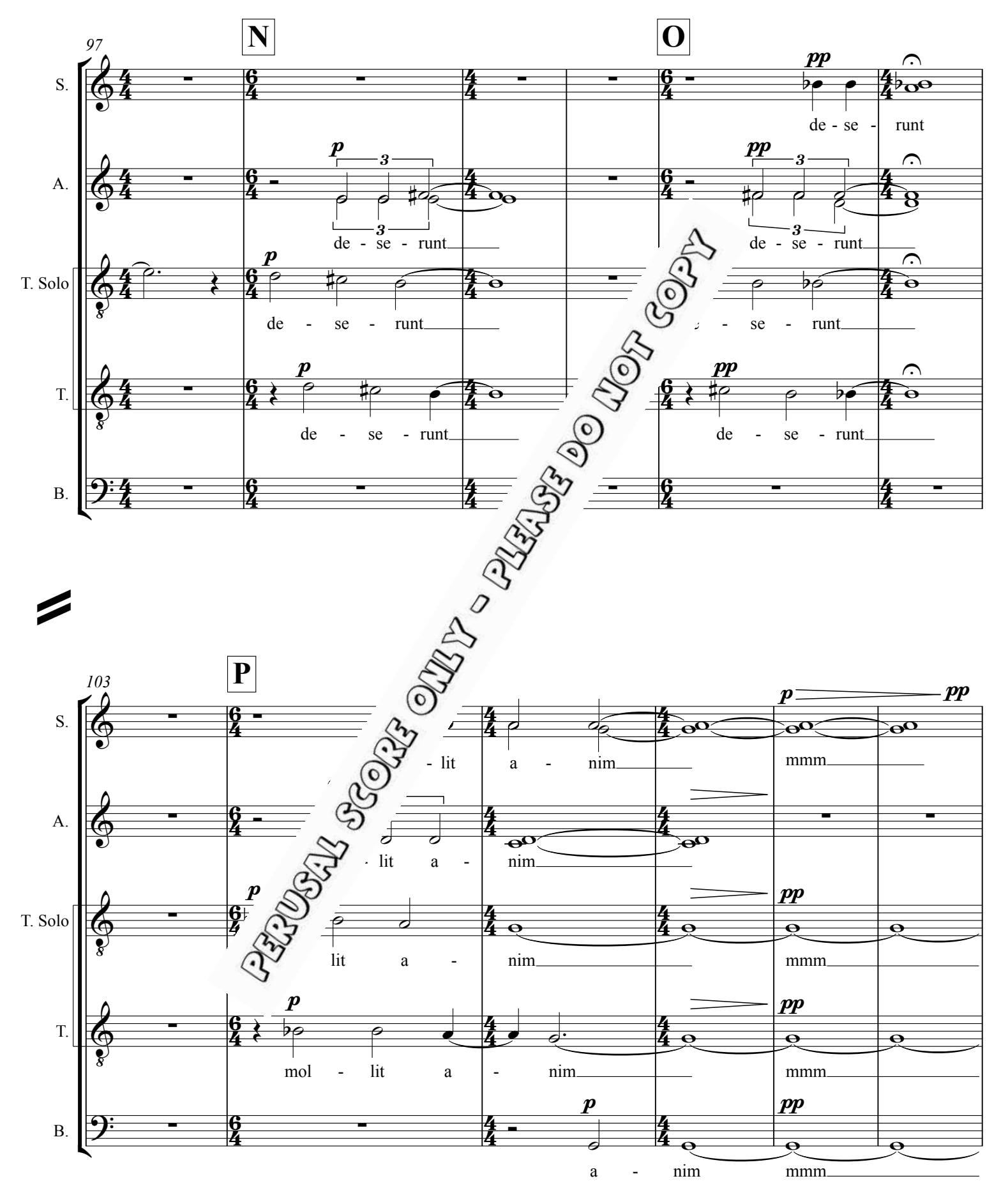
Lorem Ipsum © Jordan Nobles, North Vancouver, October 2010 www.jordannobles.com