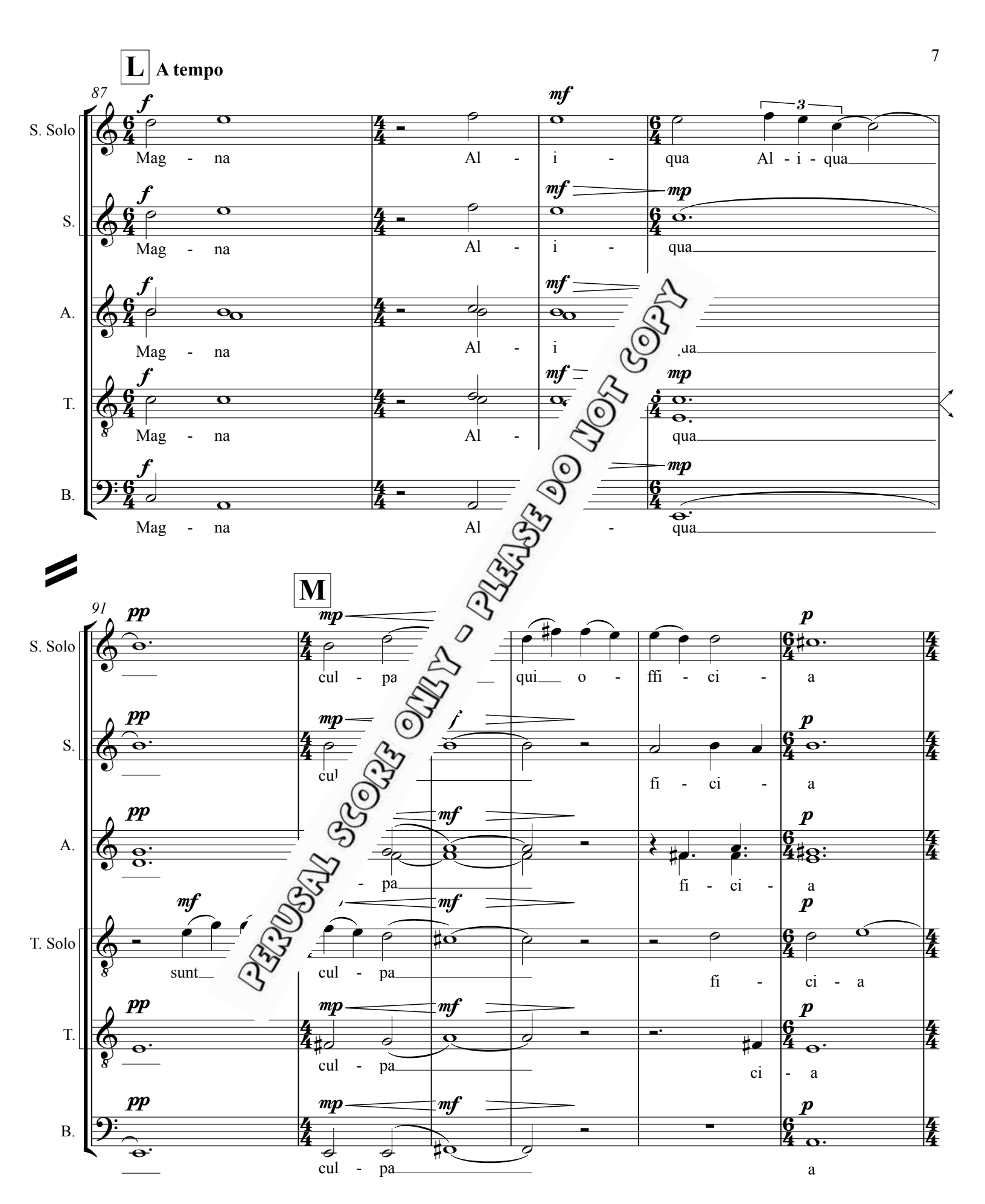
Lorem Ipsum © Jordan Nobles, North Vancouver, October 2010 www.jordannobles.com