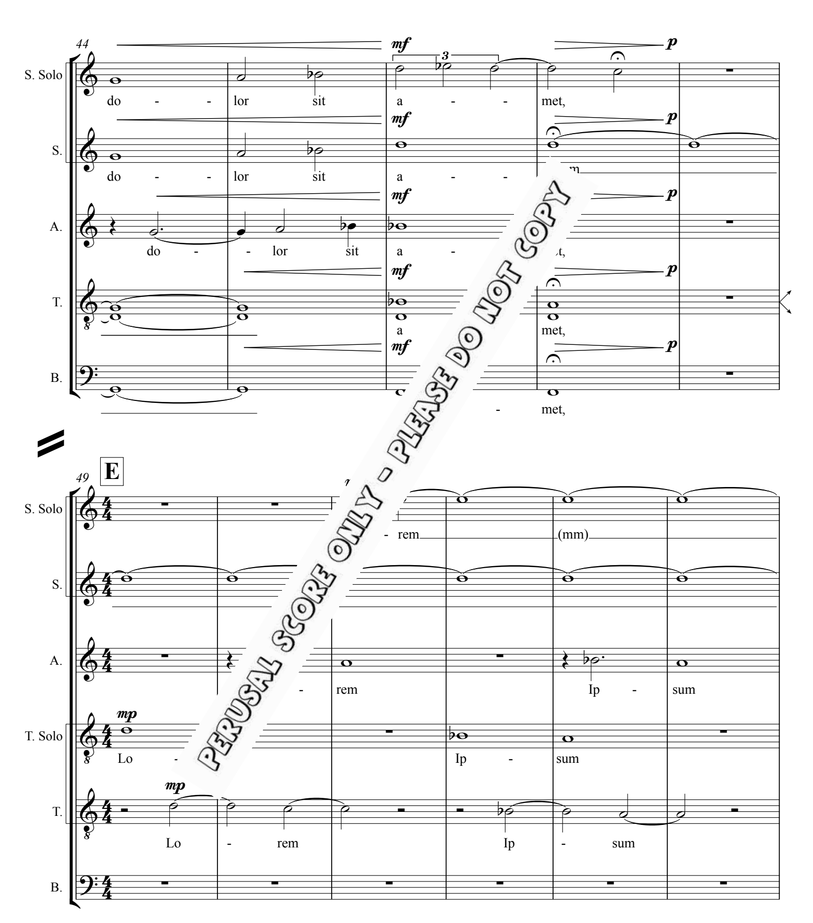
Lorem Ipsum © Jordan Nobles, North Vancouver, October 2010 www.jordannobles.com