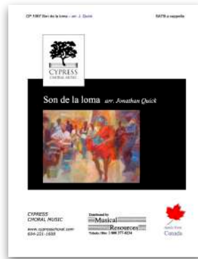
Son de la loma